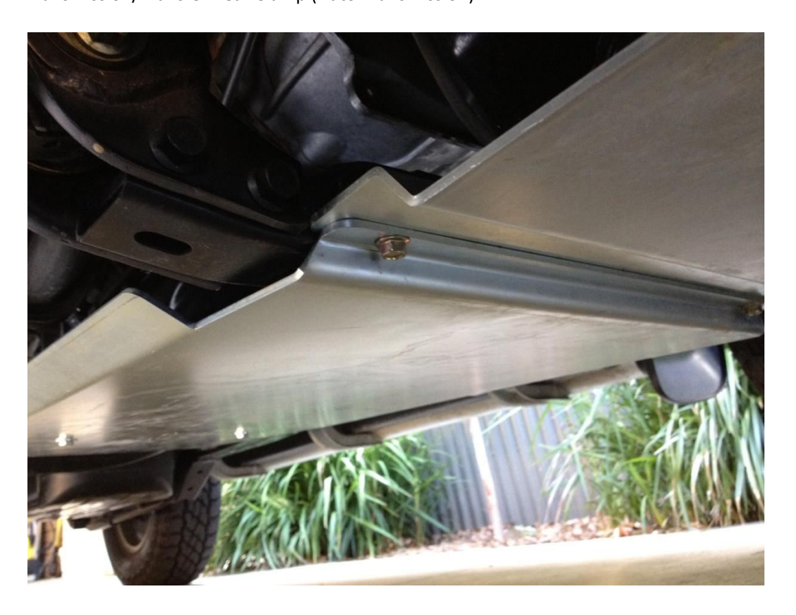
Sump and Transmission fitment